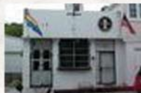
One Saloon- 514 Petronia St.