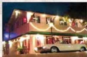
801- 801 Duval St.