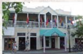
Bourbon- 724 Duval St.