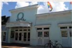
Aqua- 711 Duval St.