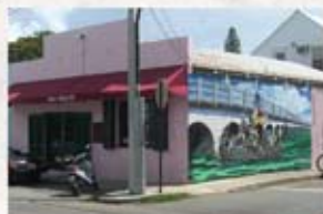
Bobby's- 900 Simonton St.