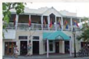
Bourbon- 724 Duval St.