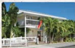
Island House- 1129 Flemingl St.