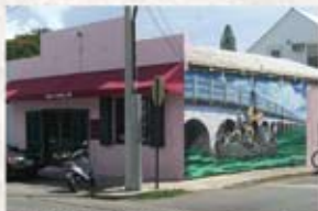
Bobby's- 900 Simonton St.