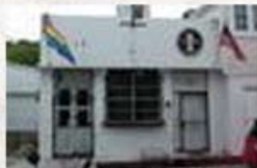
One Saloon- 514 Petronia St.