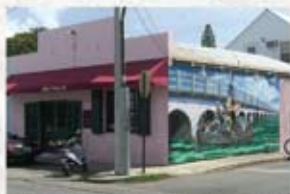
Bobby's- 900 Simonton St.