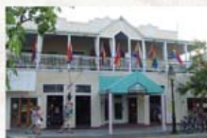
Bourbon- 724 Duval St.