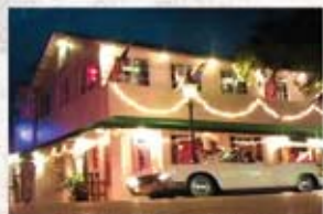
801- 801 Duval St.