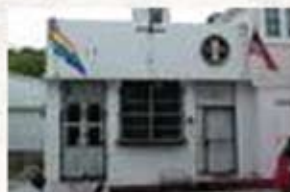
One Saloon- 514 Petronia St.