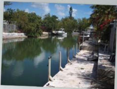
2 Beds / 2 Baths Waterfront Home