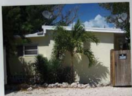
9 Ventana Lane, Big Coppitt $240,000