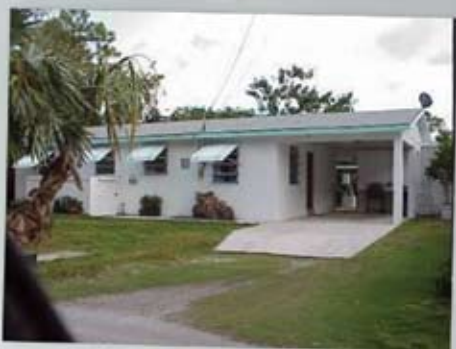
29050 Palm Ave. Big Pine Key 2 Bed / 1 Bath - Only $349,900