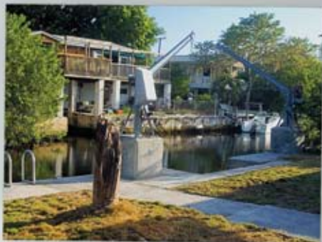
Seawall & Davits