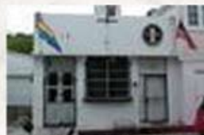
One Saloon- 514 Petronia St.