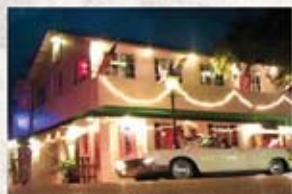
801- 801 Duval St.