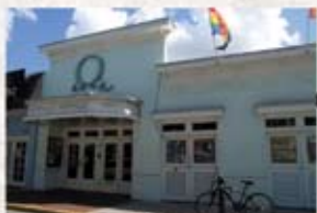
Aqua- 711 Duval St.