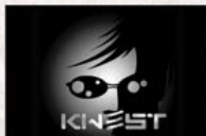
KWest- 705 Duval St.