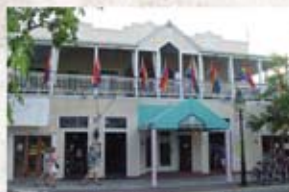
Bourbon- 724 Duval St.