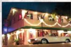
801- 801 Duval St.

Glee on the big screen at 8 PM Dancers on the bar starting at 10 PM