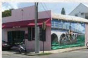
Bobby's- 900 Simonton St.