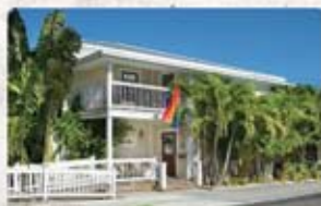
Island House- 1129 Fleming St.