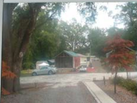
Dade City, FL Lot 800 Coconut