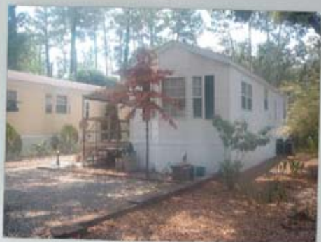
Sawmill Campground Florida's Premiere Gay Camping Resort