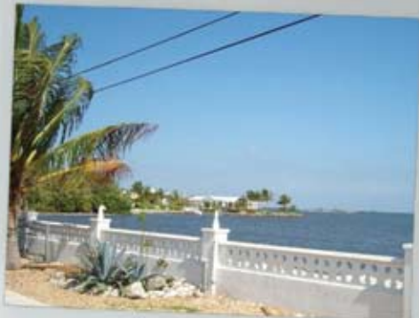
4 Beds / 1 1/2 Baths 125 foot concrete seawall