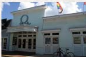
Aqua- 711 Duval St.