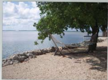
Ocean Front Estate 120 Foot of Open Water