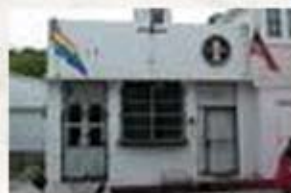
One Saloon- 514 Petronia St.