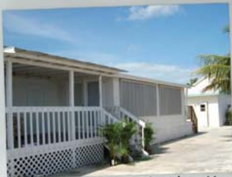
31360 Avenue J, Big Pine Key $799,000