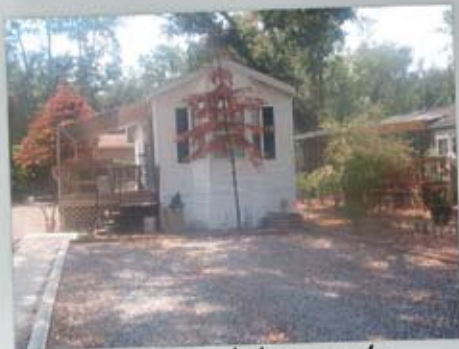
Park Model For Sale $65,000