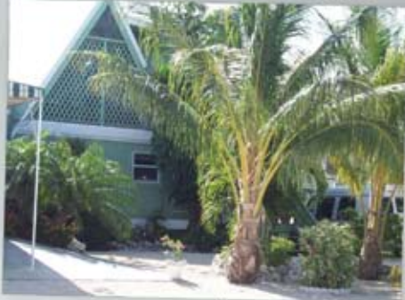
481 W. Indies Drive $990,000