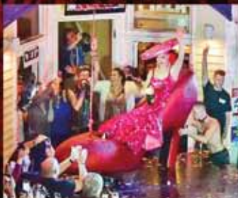
RESERVE YOUR ROOM!

Stop by the New Orleans House or call 305-293-9800 or 888-293-9893